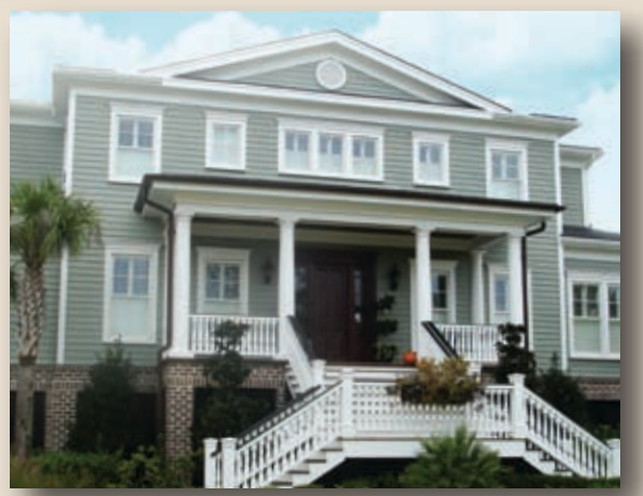
Sierra Premium™ Smooth