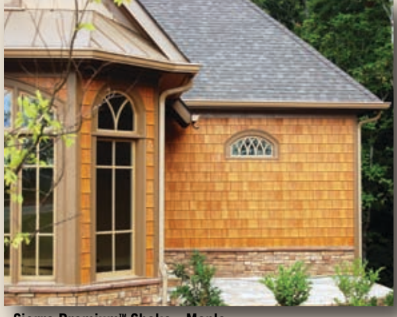
Sierra Premium™ Shake - Maple