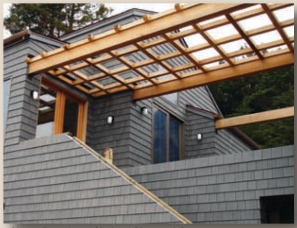
Sierra Premium™ Shake - Charcoal Gray