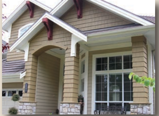
Sierra Premium™ Shake - Painted