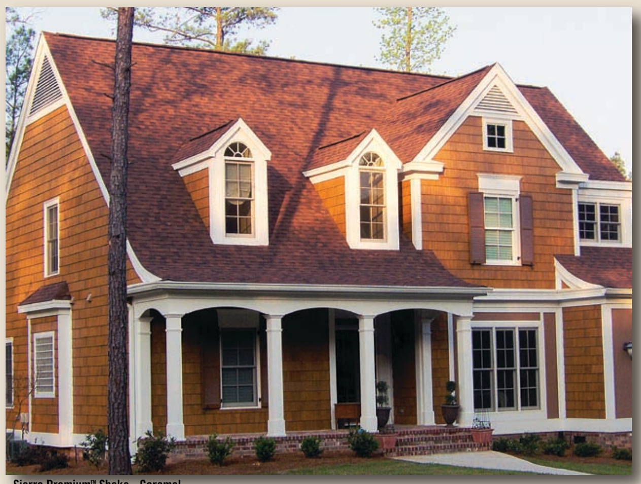
Sierra Premium™ Shake - Caramel