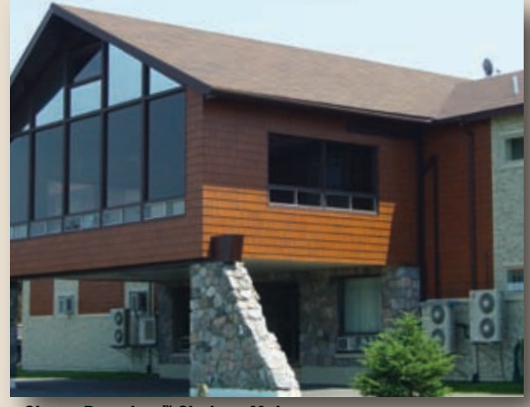
Sierra Premium™ Shake - Mahogany