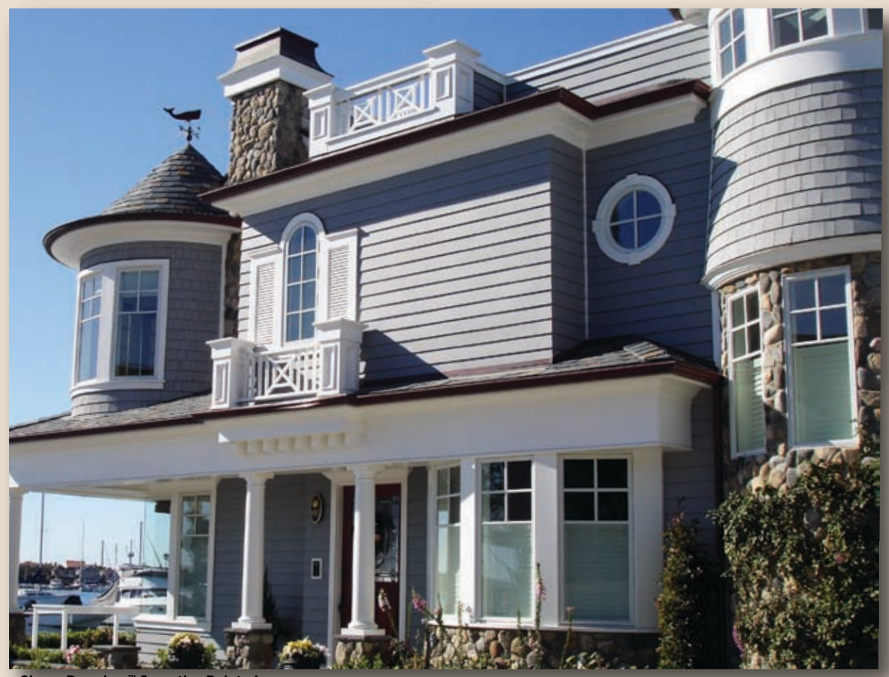
Sierra Premium™ Smooth - Painted